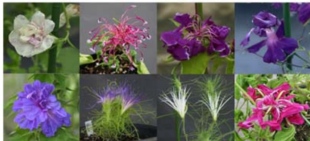
Flower morphology mutants of Morning glory