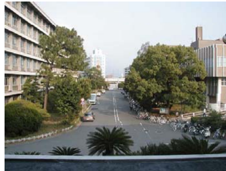
Kaizuka Campus at present