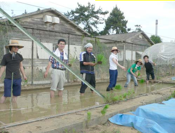
A Rice Field in Hakozaiki Campus