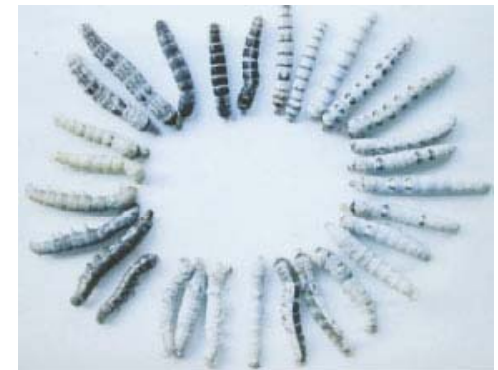
Silk worm mutants