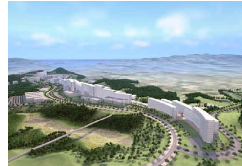
The Future Campus at Ito (Eastern Area of Fukuoka City)