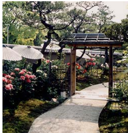
Flower garden in Hakozaiki shrine