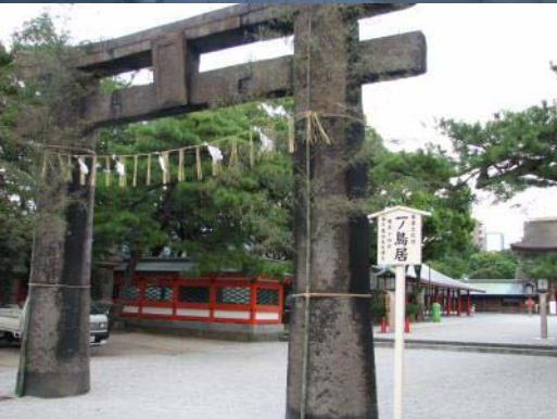
Hakozaiki Shrine and the Sacred Arch in the neighborhood of Kyushu Univ.