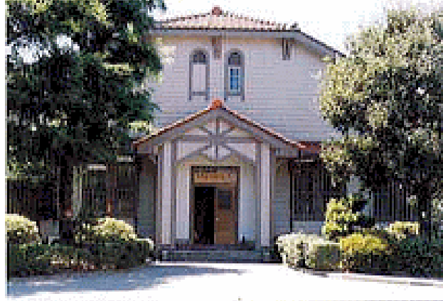
Faculty of Agriculture(above) Faculty of Sciences(below)