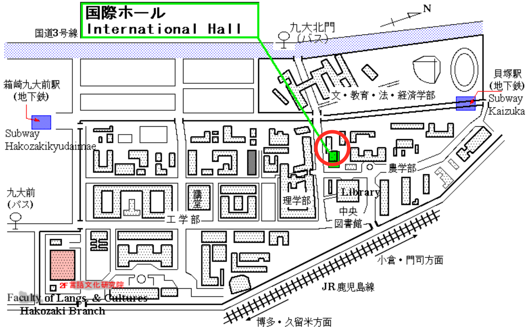
Kyushu University Hakozaeki Campus Map