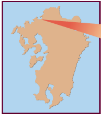
Kyushu Area of Japan

> 10 min. walk to the International Conference Hall