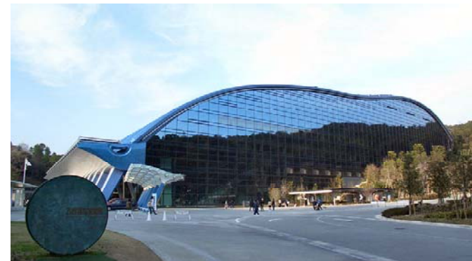
Kyushu National Museum