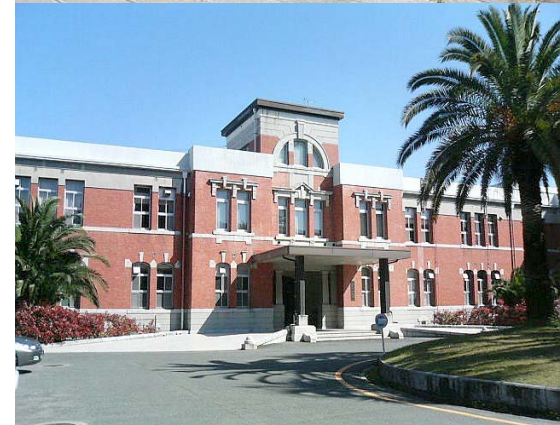
The Entrance & University Office (above) Faculty of Engineering (below)