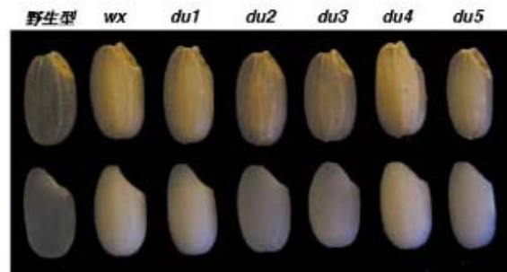
Rice mutant collection