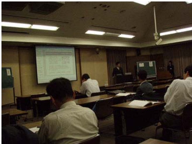
An inside View of the International Hall of the Kyushu University

The International Hall is located behind the International Affair Departments of the Kyushu University (Photo) in Hakozaki.