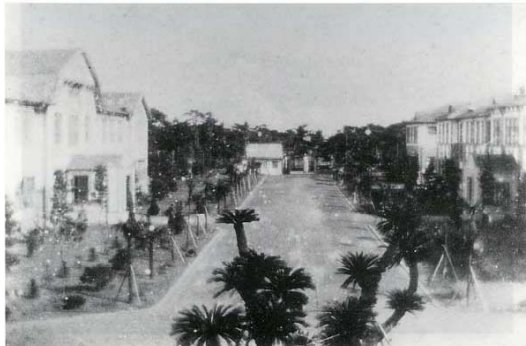
Kaizuka Campus at 1925

2015 - Faculty of agriculture will move to ITO Campus